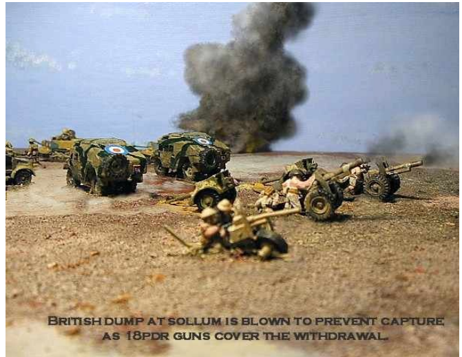
BRITISH DUMP AT SOLLUM IS BLOWN TO PREVENT CAPTURE, AS 18PDR GUNS COVER THE WITHDRAWAL.